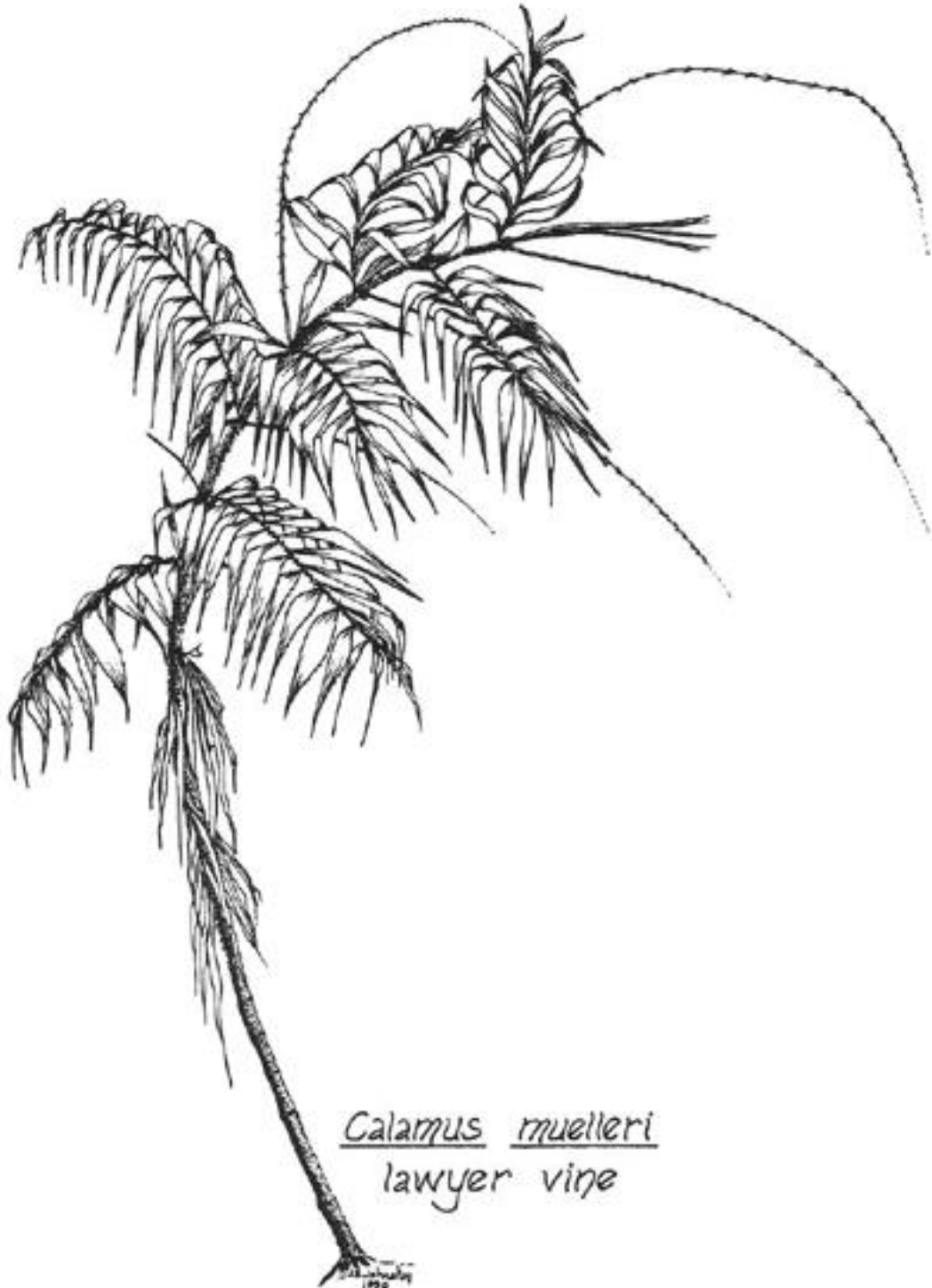
Calamus muelleri lawyer vine